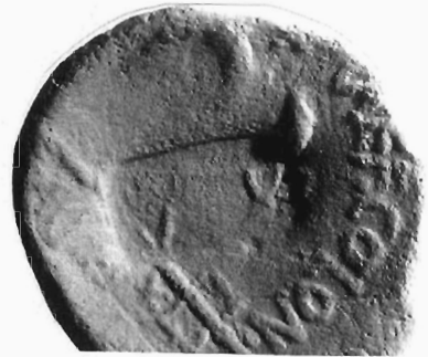
Αρ. 9 (μεγέθυνση)