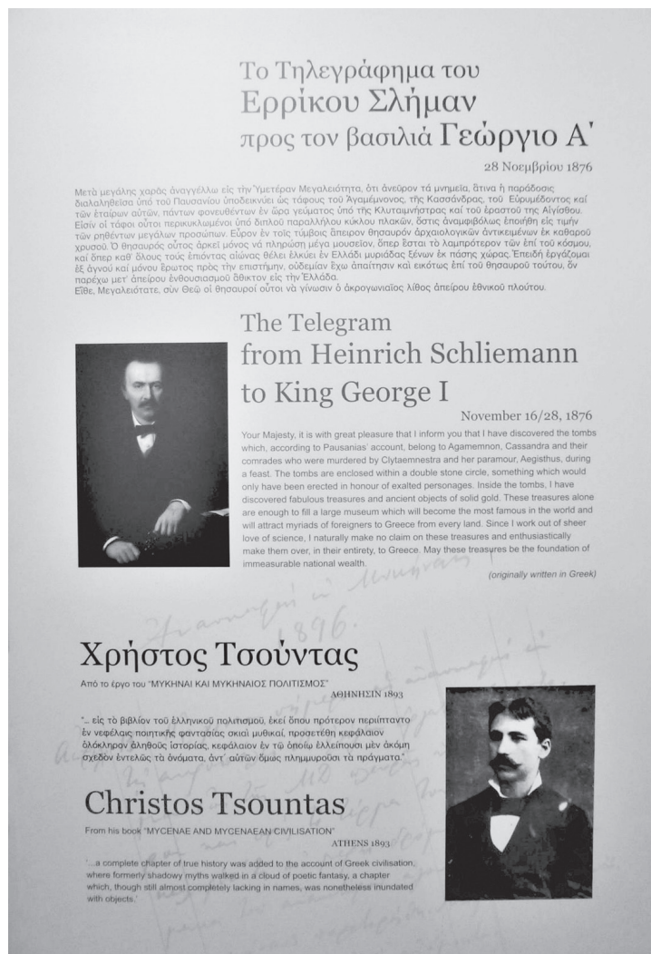
Fig. 3. Schliemann’s telegram to George I, National Archaeological Museum.

Furthermore, his discoveries from Mycenae are installed in Room 4 after the main entrance in the central wing, which is the most prominent part of the entire museum. In one of the walls in the centre of the room, opposite the display case containing the “mask of Agamemnon”, a poster reproducing a telegram from Schliemann to George I is displayed on the wall (fig. 3), which confirms that he donated all the findings to the people of Greece, a testament to Schliemann’s philhellenism.