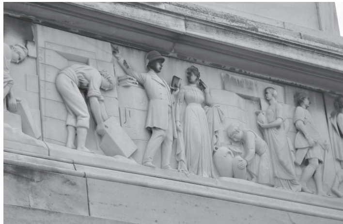
Fig. 7. Frieze on Schliemann’s tomb depicting Sophia and him, First Cemetery, Athens.