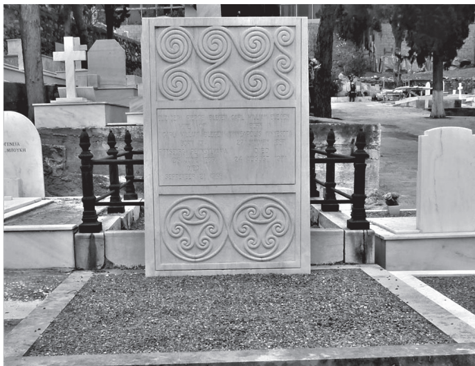
Fig. 9. Blegen's grave in the First Cemetery.