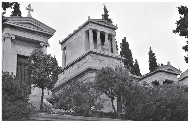
Fig. 6. Schliemann's tomb in the First Cemetery, Athens.

The construction of his residence in 1881 should be seen as a statement of a learned and wealthy individual that happened to be an antiquarian in a time when the new capital of Greece had just begun to grow. Perhaps it was also a testament to his place in the society of his time; after all, with his discoveries at Troy and Mycenae Schliemann had become an international celebrity. He had actively participated in the design and decoration of the house and in 1878 had conversed about these subjects with the German architect Ernst Ziller, who was responsible for designing many neoclassical buildings in Athens apart from Schliemann's house. 61 It is important to note that, by the time of its construction, it was one of the most impressive private residences in Athens; photographs and initial plans created by Ziller reveal that the mansion was to be constructed on a spacious plot, where it would be the most impressive building of its day, second only to the royal palace on Syntagma Square (now the parliament of the Hellenic Republic), which he designed in 1847. 62