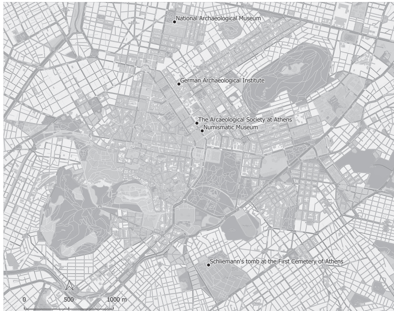
Fig. 1. Locations mentioned in the text. (Map by authors in QGIS using Stamen basemap.)

of his wife, Sophia (fig. 2), and of Greek archaeologist Christos Tsountas, is exhibited in the corridor by the main entrance.