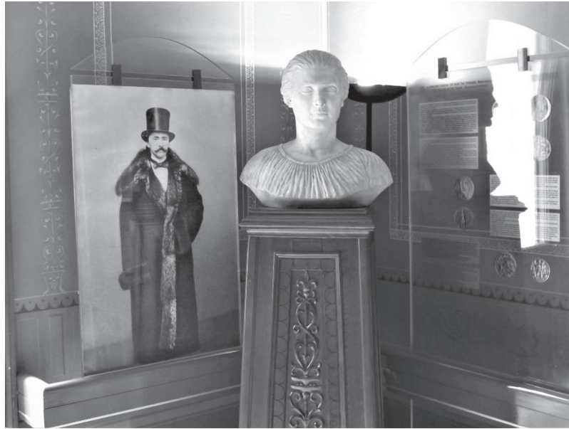
Fig. 5. Images of Heinrich and Sophia Schliemann in the Iliou Melathron (Numismatic Museum).

Unlike Schliemann's tangible presence in Athens, a comparative search for monuments dedicated to Stamatakis is revealing, but perhaps not surprising. Although he was general ephor of antiquities, a senior member of the Archaeological Society and an excavator of Mycenae and many other sites, his grave no longer exists in the First Cemetery (fig. 1), where illustrious figures are buried. Since the municipality of Athens considered the grave to be rather unimportant, Stamatakis' bones were thrown, in the best-case scenario, into a collective pit. 57 Stamatakis' memory is only preserved in the building of the Archaeological Society. His name, excavations, and some of his notes were on display in a special exhibition until 2017 but have now been moved to the archive room of the society. It is ironic that in the catalogue of the exhibition, a mural painting from a Roman tomb unearthed by Stamatakis, is published next to a photograph of Schliemann. 58 One