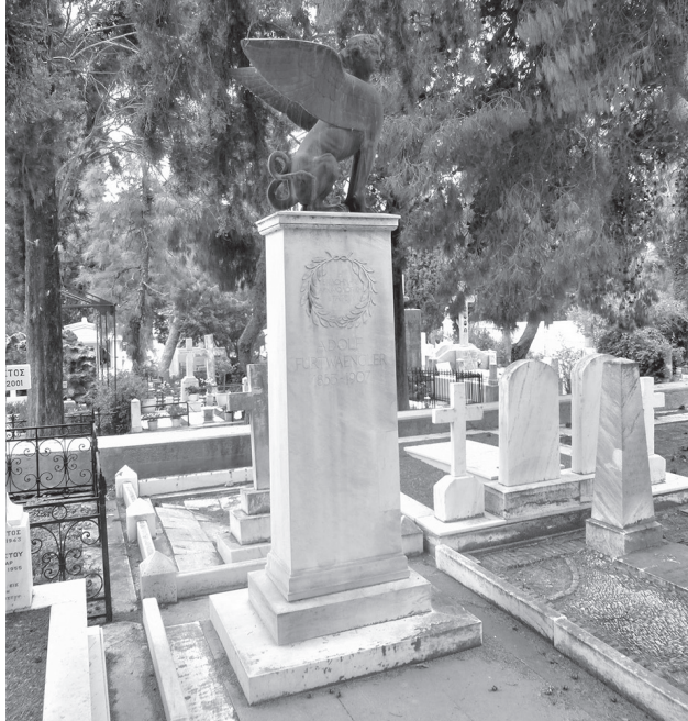
Fig. 11. Furtwängler's grave. The low enclosure of the Protestant section of the cemetery can be seen behind the tomb.