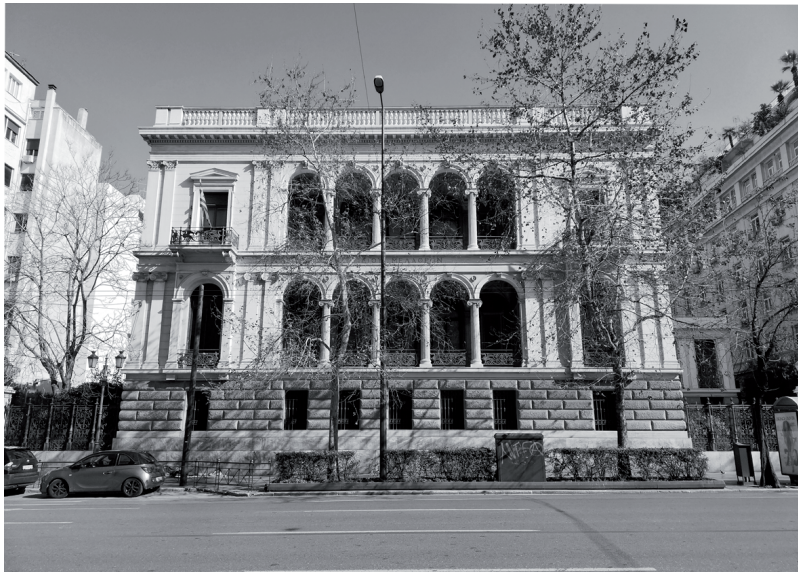
Fig. 4. Iliou Melathron (Numismatic Museum), Athens.

Leaving the Archaeological Museum and heading towards Syntagma Square via Panepistimiou Street, the visitor will encounter the DAI on Fidiou Street (fig. 1), which, after its establishment in 1874, was housed in this neoclassical building that was commissioned by Schliemann and purchased by the German state in 1898. 55 It is perhaps fitting that a bust depicting him can also be found here, marking his association with the institute and, by extension, his position as a founding father of archaeology in Greece. On Panepistimiou Street, the visitor passes through the neoclassical trilogy of Athens (the National Library, the University of Athens and the Academy of Athens), followed by the city's first ophthalmological hospital; in the opposite corner one finds the building of the Archaeological Society at Athens (fig. 1), where Schliemann is commemorated by a stele in the main lobby among other great donors. A photo of the archaeologist in Mycenae was displayed in a recent exhibition dedicated to the excavations conducted by the society. 56 A few meters beyond the Archaeological Society one can see Schliemann's mansion (fig. 1), known as the Iliou Melathron (fig. 4), which today houses the Numismatic Museum. Portraits of Schliemann and Sophia hang on the walls, and an entire room is dedicated to their personages (fig. 5).