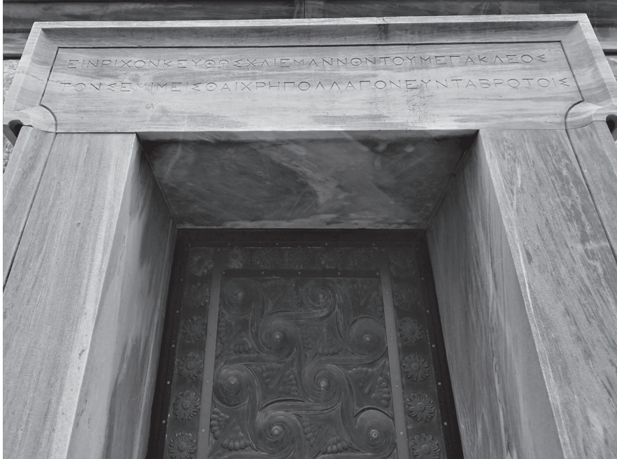
Fig. 10. The bronze door on Schliemann's tomb, First Cemetery, Athens.

On Blegen's grave, the symbol is carved on the tombstone but on Schliemann's tomb it is engraved in the bronze front door (fig. 10). 86 Even Furtwängler's grave, with the magnificent bronze sphinx, is restricted to a much smaller space (fig. 11). That these two archaeologists chose to have more modest burial monuments compared to Schliemann's is a testament not only to their lower economic status but also to their desire to emphasise their work instead of their personalities and self-proclaimed heroism. But be that as it may, in the end, it was Schliemann's megalomania and fervent desire for posthumous glory that prevailed since it is he who has left his mark in the world of Greek archaeology, he who is most remembered to this day by the public, and he who appears in school textbooks as the preeminent figure of his era, even if academics today do not recognise him as a great archaeologist.