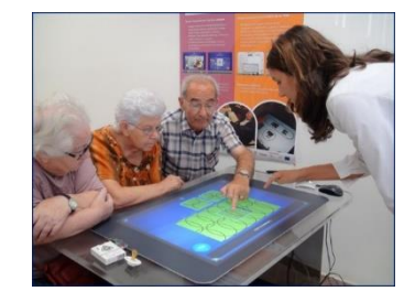
eHealth, Independent Living and Accessibility