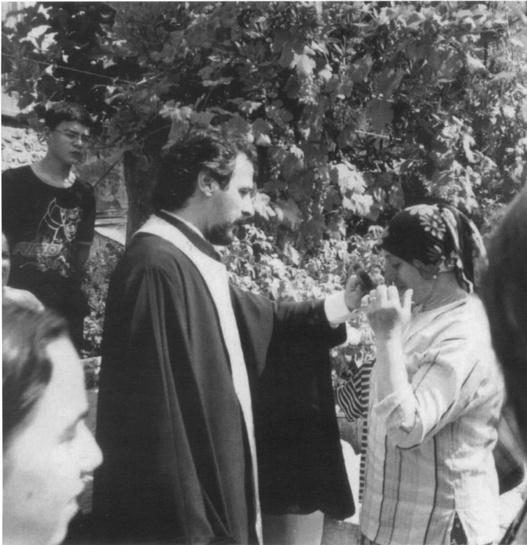
Fig.10.4: Holy Spring of the Dormition of the Virgin Vefa, Istanbul, 1 July 2006; author's photograph.

work: Encounters between Christianity and Islam under the Sultans . It should be clarified also that the chronological breadth of the material evidence — primarily archaeological — recorded in the work is such that the term Sultans should be taken as referring not only to those of the House of Osman but also to the Seljuk Sultans of Konya who preceded them.