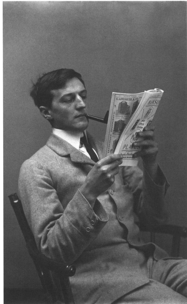
Fig.10.1: F.W. Hasluck; BSA Photographic Archive: SPHS-6266.

Christianity and Islam precisely records and documents two facts of life of pre-modern society that are totally intolerable to nationalism. One is the pervasive cultural and social syncretism which defines life in pre-modern society. Hasluck chose to focus on the most symbolically evocative expression of syncretism in pre-modern society, its religious aspect, which has left