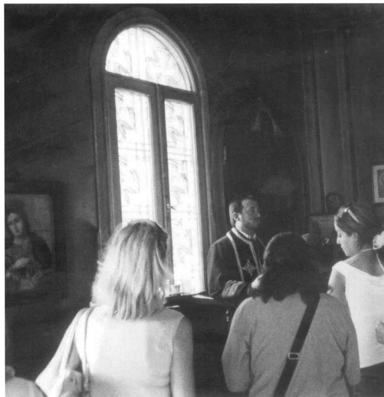
Fig.10.5: Holy Spring of the Dormition of the Virgin Vefa, Istanbul, 1 July 2006