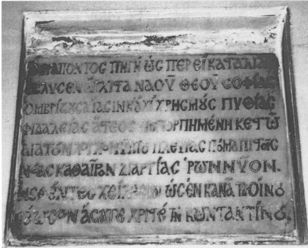
Fig.10.6: Foundation inscription, St Therapon holy spring, Istanbul; author's photograph.