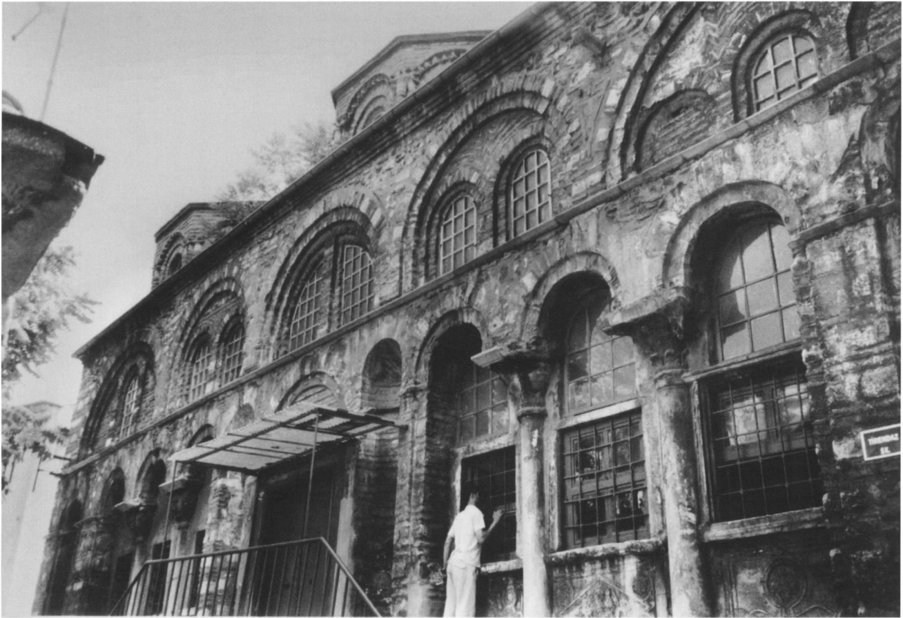
Fig.10.2: The Kilise Mosque, Church of St Theodor; Istanbul.

The second fact of life in pre-modern society that seems to emerge from Hasluck's account is the fluidity and plasticity of religious and ethnic identities, which seem at any given point along the trajectory of pre-modern society — that is in society before its attachment to the modern state — to be capable of a number of alternative forms of subsequent development. This is precisely what negates the historical teleology presupposed by nationalism, which understands forms of pre-modern ethnic consciousness as just preparatory stages in a foreordained course of development leading up to national plenitude. It is this teleological logic that is negated by the documentation of syncretism, and by the way it makes imaginable the potential of multiple alternative future collective destinies for particular population groups.