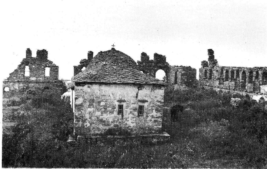
Figure 20.5. Ruins of the Athonite Academy. Photograph by Stavros Mamaloukos, May 1994.